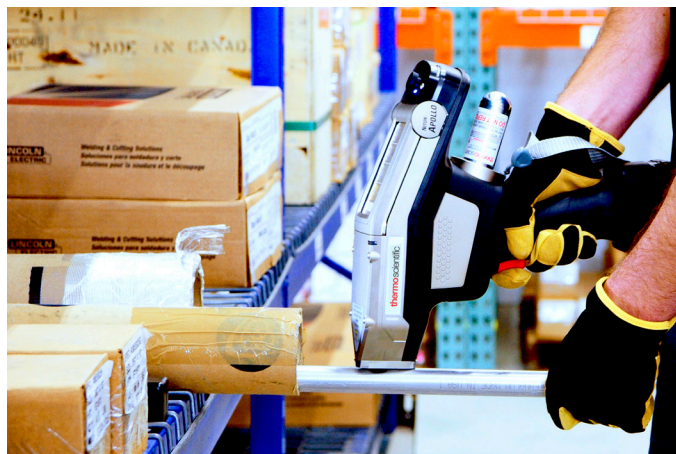
The Niton Apollo in use, validating a Mill Test Report (MTR) prior to fabrication.

Among other material verification methods, the Mill Test Report (MTR) is sometimes utilised to validate goods. In certain cases, the MTR can be unreliable or incorrect due to a mix up in the labelling process. It is best practice to perform a second validation of the MTR to verify goods. Catching the issue at the forefront of inspection – using elemental analysis – avoids the costly problem of determining goods have been developed out of specification after adding value during the fabrication process. Oftentimes, the resulting occurrence must be scrapped entirely.